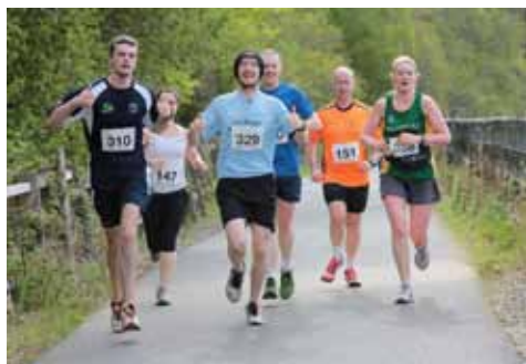
HAPPY RUNNERS COMPETING IN THE LAKES OF KILLARNEY MARATHON, LAST YEAR.

It might not help you run any faster but the magnificent backdrop through the Killarney