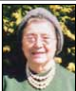
In loving memory of