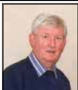
In loving memory of