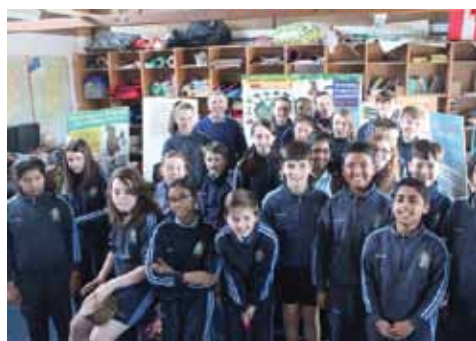
PUPILS AT ST OLIVERS LEARN TO TACKLE CLIMATE CHANGE

St Oliver's, National School, Ballycasheen, invited "Just Forests" in to help raise the pupil's awareness of how 'local' actions can have 'global' impacts both negative and positive.