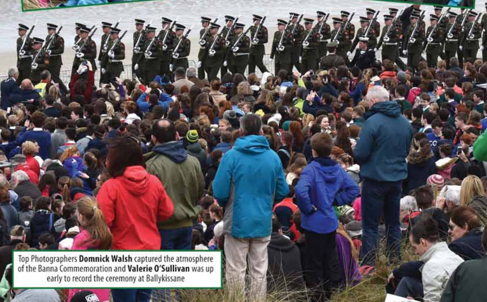
Top Photographers Domnick Walsh captured the atmosphere of the Banna Commemoration and Valerie O'Sullivan was up early to record the ceremony at Ballykissane