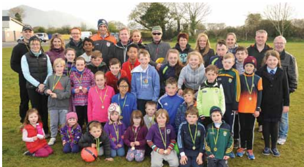
A GROUP OF PARTICIPANTS, PARENTS AND OFFICIALS AT THE KILLARNEY SOUTH COMMUNITY GAMES ATHLETICS QUALIFIERS AT ST. OLIVER'S NATIONAL SCHOOL, KILLARNEY ON TUESDAY NIGHT.

All updates on www.facebook.com/KillarneyValleyAC