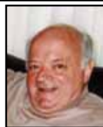
Mass for the late