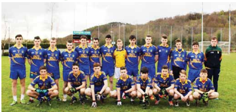
SPA GAA U16 BOYS.

HEALTHY CLUB: Beaufort will be taking part in Healthy Club 2 from May 2016 to June 2017. Anybody who want to help out with activities,