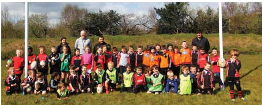
KILLARNEY RUGBY MINIS PICTURED AT THE END OF SEASON WHICH TOOK PLACE AT AGHADOE LAST SATURDAY.