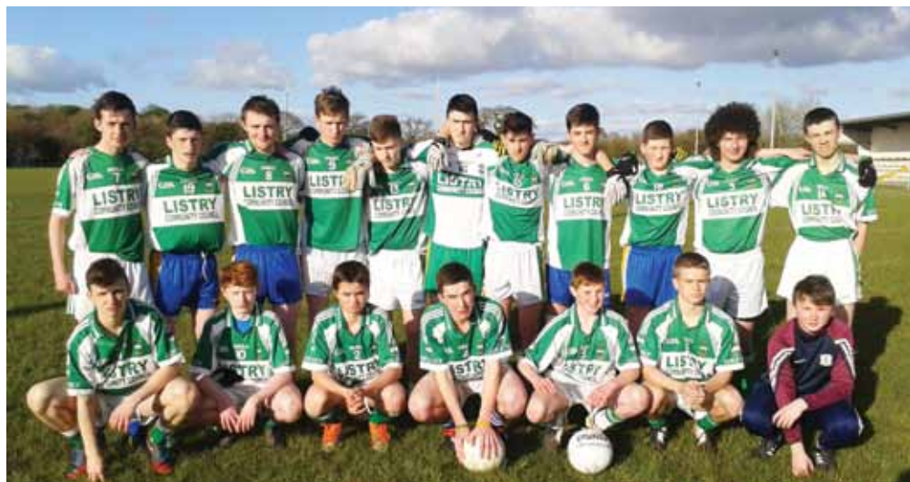
THE LISTRY KEEL U16'S TEAM FOLLOWING THEIR VICTORY OVER ANNASCAUL - LISPOLE ON MONDAY NIGHT.