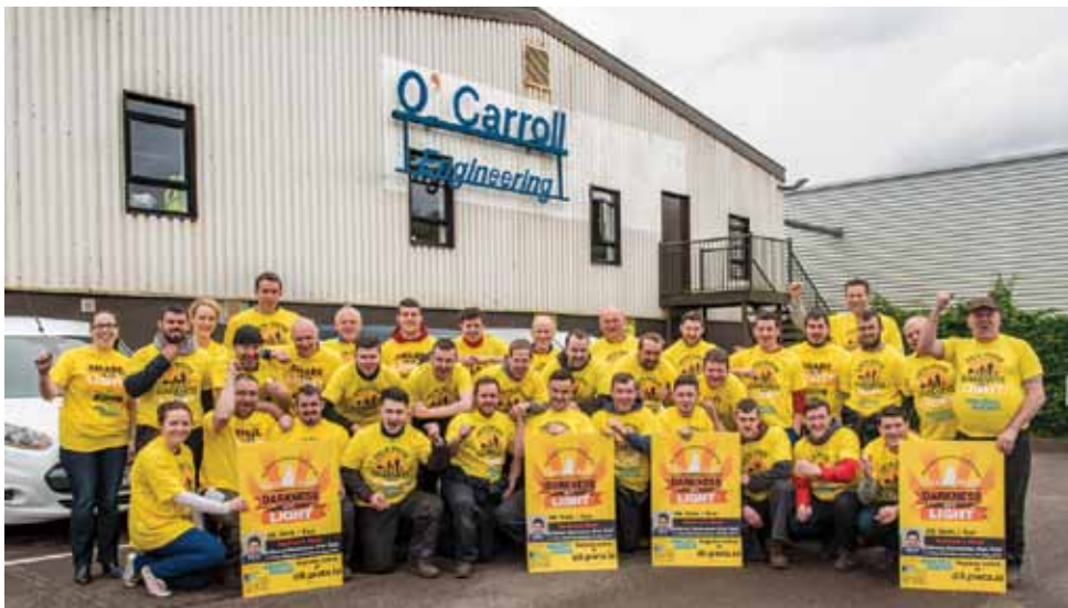
MEMBERS OF THE O'CARROLL ENGINEERING FIRM IN KILLARNEY ALL SUPPORTING THE DARKNESS INTO LIGHT WALK WHICH IS SUPPORTED BY ELECTRIC IRELAND AND TAKES PLACE ON MAY 7TH.