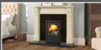
STOVES & FIREPLACES

CLEARANCE SALE UP TO 55% ON SELECTED KITCHEN TILES