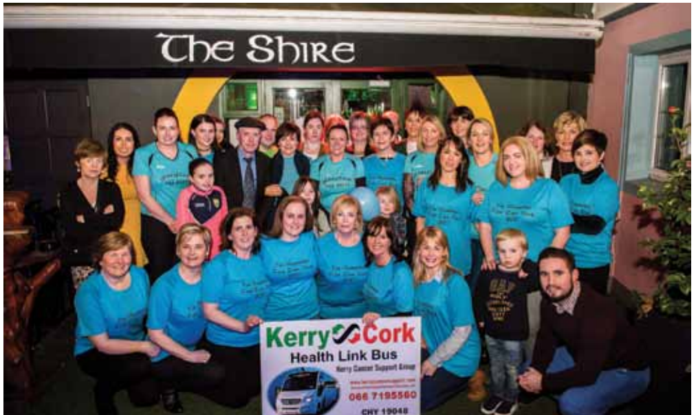
A HUGE TURN OUT TO THE LAUNCH OF 'AG RITH', INCLUDING TD MICHAEL HEALY RAE AT THE SHIRE. THE 5K FAMILY FUN RUN WILL TAKE PLACE ON SUNDAY, JANUARY 29TH IN GLENFLESK TO RAISE FUNDS FOR THE CORK KERRY CANCER BUS LINK.