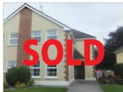
2 RIVERSIDE DRIVE, KILLARNEY, CO. KERRY