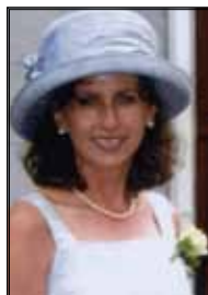
In Loving Memory of a dear daughter in law, sister in law and auntie.