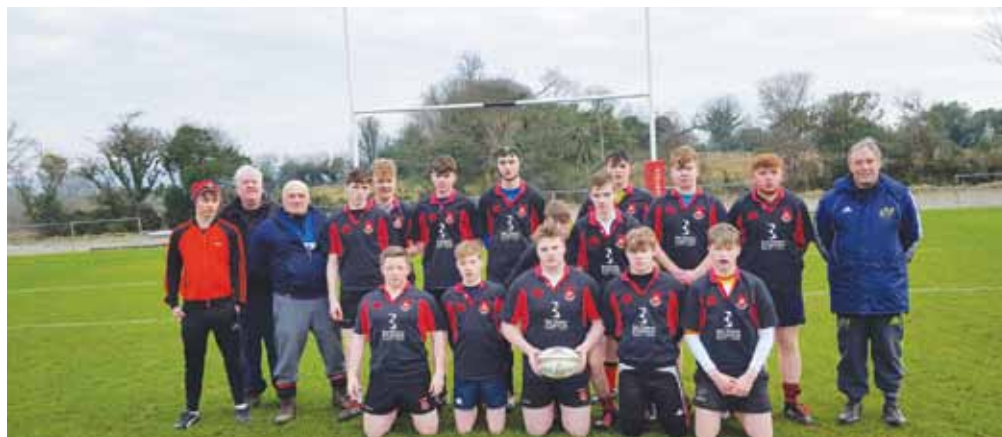
KILLARNEY RFC'S U18 PRIOR TO A GAME AGAINST CORCA DHUIBHNE LAST SATURDAY.