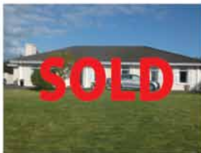
BOULIA, FIRIES, KILLARNEY, CO. KERRY