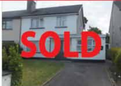
7 COUNTESS GROVE, KILLARNEY, CO. KERRY