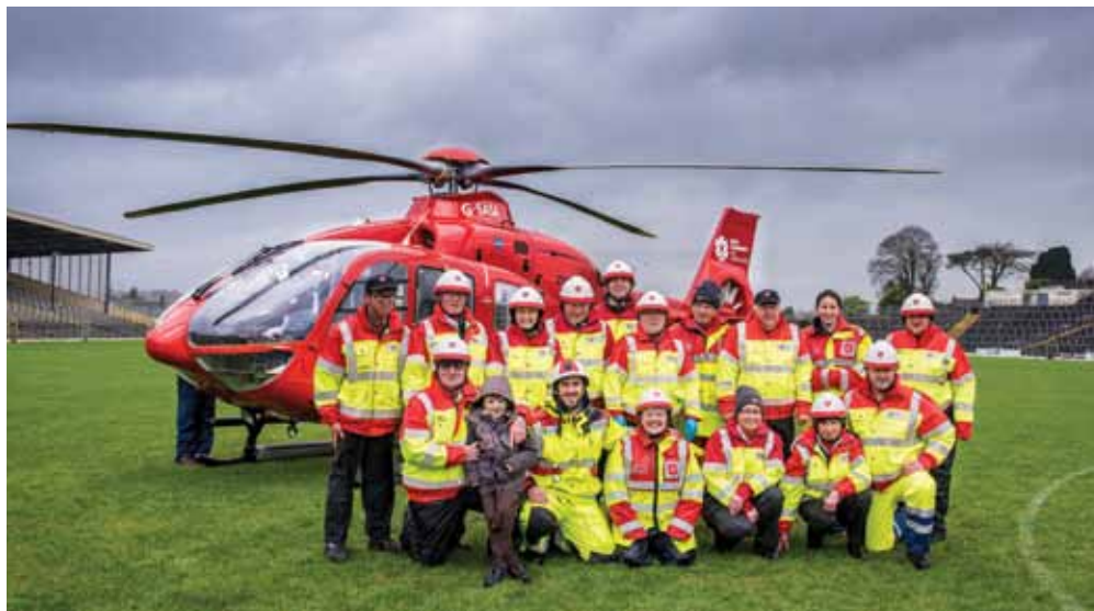
KILLARNEY'S ORDER OF MALTA TEAM PICTURED AT FITZGERALD STADIUM WITH THE NEW HELICOPTER, A NEW SERVICE AVAILABLE TO THE PEOPLE OF KERRY IN THE COMING MONTHS.

The Irish Community Air Ambulance (ICAA) touched down in the Fitzgerald Stadium in Killarney yesterday morning as part of a promotion to introduce the new Helicopter Emergency Medical Service (HEMS) which is set to begin later this year in Munster and South Leinster.