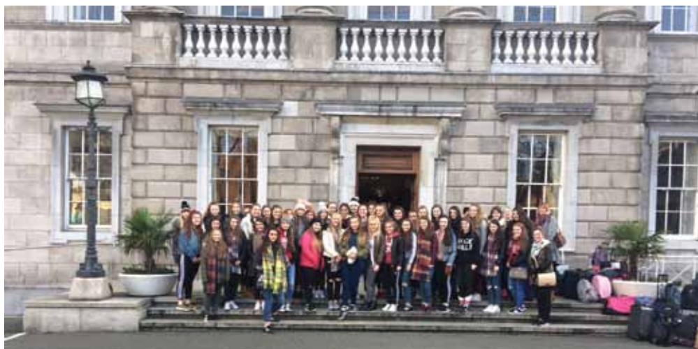
ST. BRIGID'S SECONDARY SCHOOL TRANSITION YEAR STUDENTS.

On Wednesday the 11th of January the Transition Year group of St. Brigid's Secondary School went on their annual TY trip to Dublin