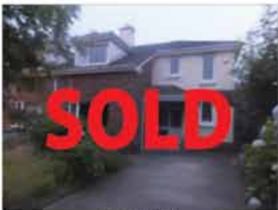
6 BROOKLAWN, KILLARNEY, CO. KERRY