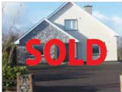
CUMMEEN, KILLARNEY, CO. KERRY