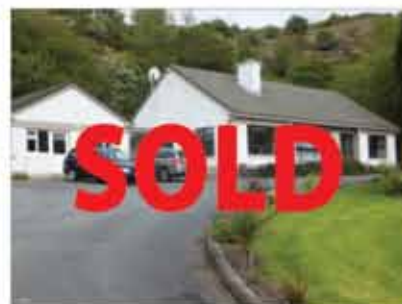
"WHITE LODGE", BALLYHAR, KILLARNEY, CO. KERRY