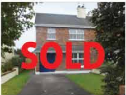
39 KING'S PARK, KILLARNEY, CO. KERRY