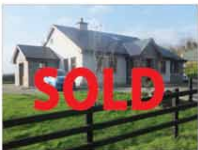
2 BARLEYMOUNT EAST, KILLARNEY, CO. KERRY