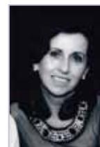
In loving memory of our dear friend