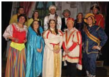
THE LEADS IN MARIAN PLAYERS PRODUCTION OF SLEEPING BEAUTY.

Marian Players Rathmore are preparing to present their 30th annual Panto. Sleeping Beauty will take to the stage with its first performance on Saturday 28th January in Rathmore Community Centre at 7.30pm and continues on selected dates up to February 5th. Matinee show at 3 pm on Sundays.