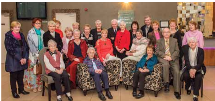
PICTURED AT THE KILLARNEY OAKS HOTEL FOR THE ANNUAL FRANCISCAN FRIARY EVENING OUT WERE THE EUCHARISTIC MINISTERS, READERS & FLORISTS.