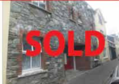
8 LARTIGUE COURT, KILLARNEY, CO. KERRY