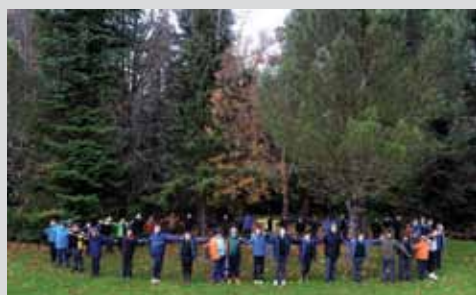
STUDENTS FROM THE MONASTERY NATIONAL SCHOOL EMBRACING THE MEMORIAL GROVE – MONSIGNOR HUGH O'FLAHERTY WAS A PAST STUDENT OF THE MONASTERY NATIONAL SCHOOL.

Killarney Chamber and the Hugh O'Flaherty