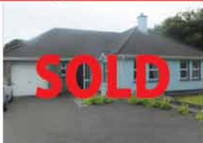
6 MEADOWLANDS, ARTIGALVIN, KILLARNEY, CO. KERRY