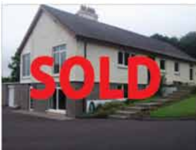
KNOCKLEBEDE, KILCUMMIN, KILLARNEY, CO. KERRY