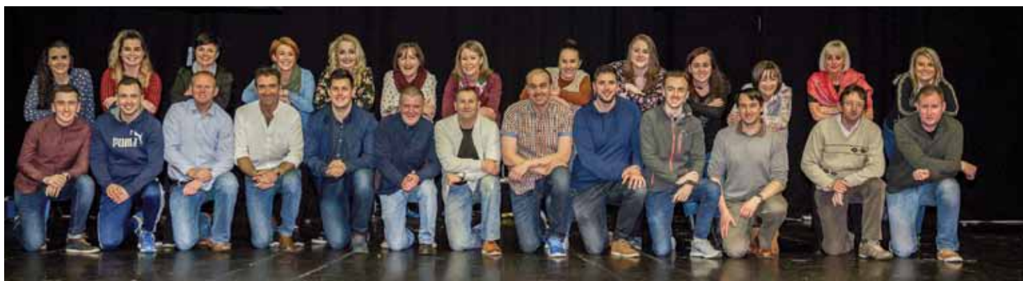
STRICTLY COME DANCING 2017.

It's that time of year again, the countdown to the 2017 Strictly Come Dancing Killarney is well underway. The Killarney/South Kerry Branch of the Irish Cancer Society are back for their third year running with this year's theme..Strictly Goes Back to the 80's'. We can look forward to a great night of entertainment on Friday 10th February in the INEC. Taking to the stage, will be 26 dancers from the local community. The talented troupe includes teachers, hairdressers, business people and care workers. This week in the Killarney Outlook we take a look at the first