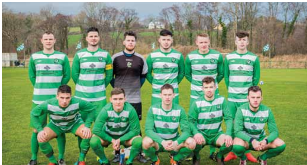
KILLARNEY CELTIC TEAM PICTURED AT CELTIC PARK WHO PLAYED AGAINST RINGMAHON RANGERS CORK IN THE MUNSTER JUNIOR CUP.