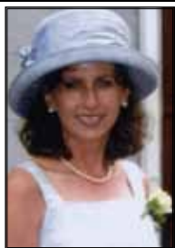
In Loving Memory of