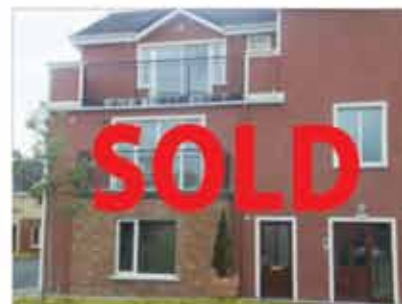
COLL CORRAN, PARK ROAD, KILLARNEY, CO. KERRY

Due to the large number of completed Sales and Lettings, Hennigan Auctioneers urgently require Properties to Sell and to Let All Areas, No Sale - No Fee, No Let - No Fee