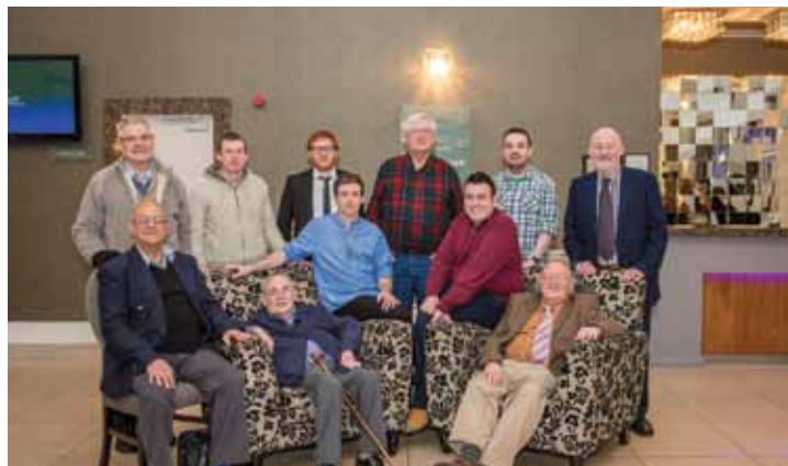
THE FRANCISCAN FRIARS, FONDLY KNOWN AS "THE FRIAR BRIGADE" PICTURED AT THE KILLARNEY OAKS HOTEL FOR THEIR ANNUAL GATHERING.