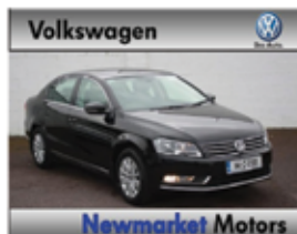
2014 Passat CL 1.6TDI 33km €24,000