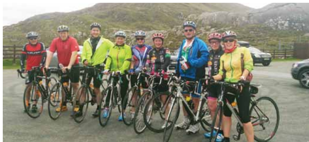
LAST YEARS CYCLE WAS A GREAT SUCCESS.

The call is out for the 5th Annual 80 km Resource Cycle in aid of Barraduff National School will take place on Sunday 22nd May 2016.