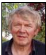
In loving memory of