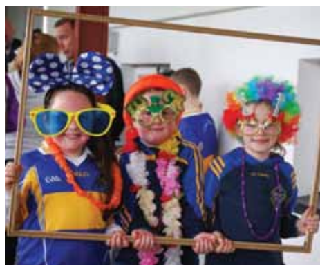
ALL SMILES AT ALL SMILES AT GLENFLESK LA NA GCLUB.