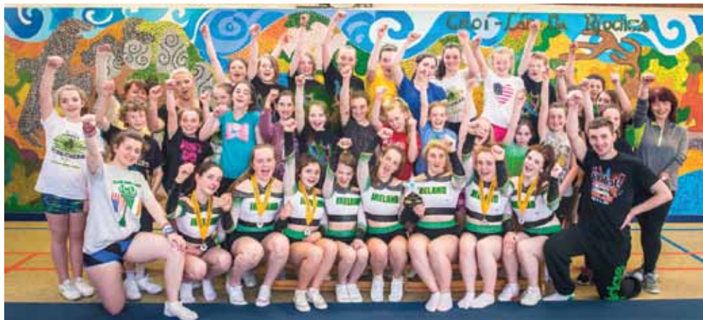
THREE CHEERS FOR TEAM IRELAND CHEERLEADERS FROM THEIR HOMETOWN OF KILLARNEY SUPPORTED BY THE COLLEAGUES AT KILLARNEY SCORCHERS.