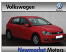
2015 Golf 1.6TDI 35km €22,250