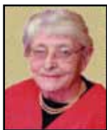
In loving memory of