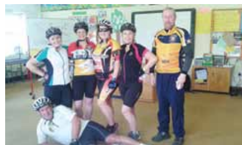
IN TRAINING FOR THE CYCLE.

Then it's back to the comfort of John Dan's Bar in Barraduff for a soup and a sandwich, with a great tasty free spread on offer, supplied by local parents and volunteer bakers. So save the date in your diary and get training for this year's Cycle through some of the Kingdom's most amazing and breath taking scenery – you'll be so glad you did it! Barraduff NS Parents Council is hoping for a great turn-out again this year to raise much needed funds for our local school. All the children will benefit hugely from the purchase of educational resources to meet their needs.