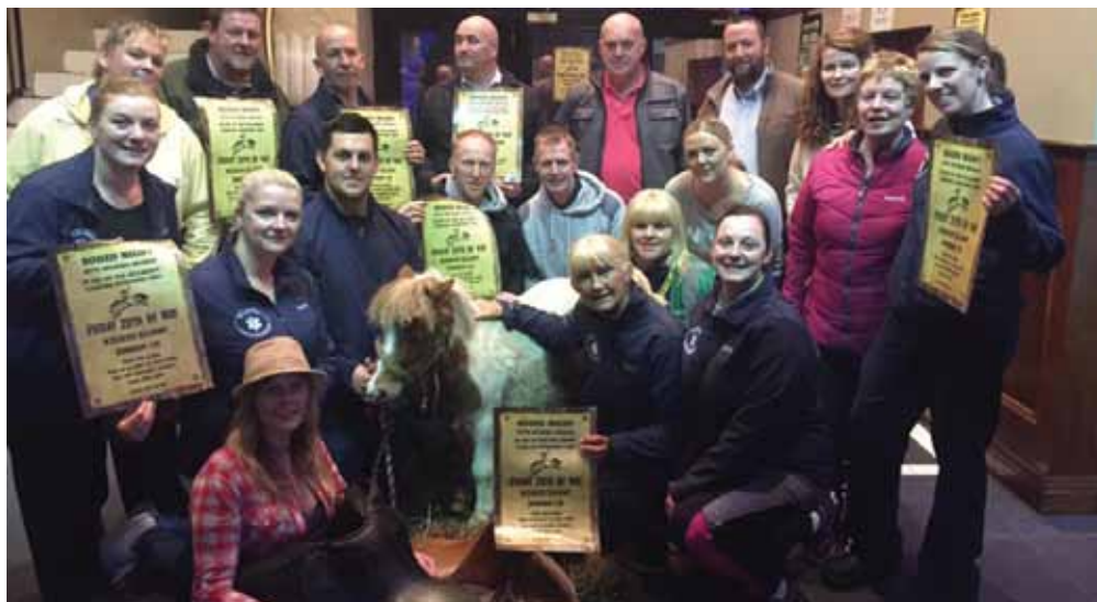
MEMBERS OF THE KILLARNEY CARDIAC RESPONSE UNIT LAUNCH RODEO NIGHT AT MCSORLEY'S.

A Rodeo night with a Bucking Bronco will be held at McSorley's in Killarney on Friday May