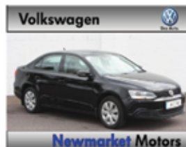
2014 Jetta TL 1.6TDI 39km €19,500