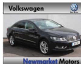
2014 CC Sport 2.0TDI 49km €31,000