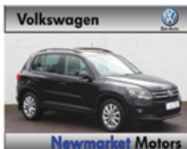
2014 Tiguan Life & Leisure 2.0TDI 49km €23,000