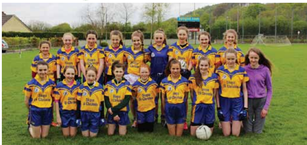
SPA U14 GIRLS.