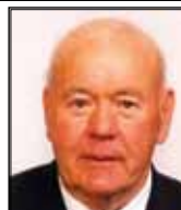
In Loving Memory of