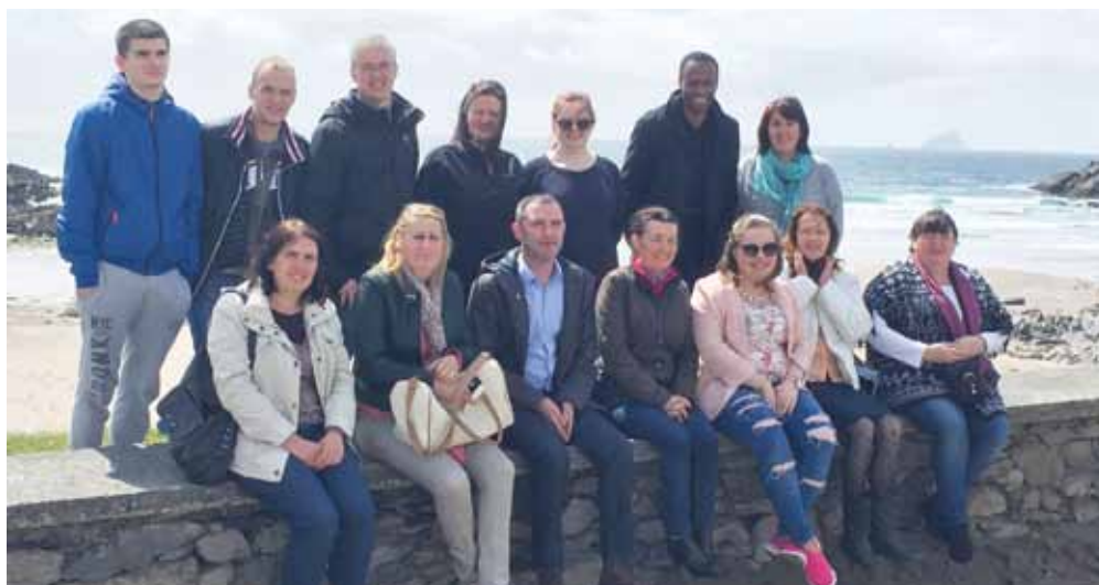
SKILLNET'S HOSPITALITY GRADUATES ON A FACT FINDING TOUR OF THE RING OF KERRY.

Following the successful completion of the second South Kerry Skillnet's Hospitality Skills Course all 16 graduates have been guaranteed full time employment in the sector if they successfully complete a one week trial period. The course participants undertook the seven week course as part of the Skillnet Job Seekers Support Programme and developed skills in areas such as accommodation, food and beverage, manual handling and bar service. In addition, they under QQI accredited modules in the areas of customer service, food safety and first aid. On completion of the course the students undertook a fact finding tour around the Ring of Kerry last week to be able to provide first-hand information to visitors to the region as to the attractions and activities they could enjoy on their visit. Among the areas the group visited were Valentia Island where they were hosted by the Valentia Island Development group, Skellig Chocolates, the Jam restaurant facility and the Park Hotel