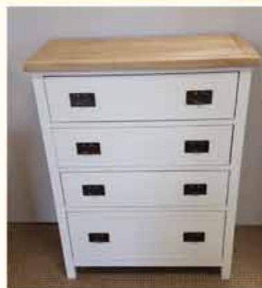
Solid Oak 4 drawer chest, in cream & oak Was €399