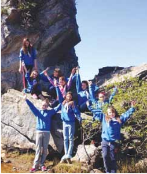
MEMBERS OF MANGERTON GUIDES, KILLARNEY, PICTURED ON THEIR HIKE FROM MUCKROSS TO DINIS, WHICH THEY UNDERTOOK AS PART OF IRISH GIRL GUIDES' TREK FROM THE NORTH POLE TO THE SOUTH POLE.

Girl Guides from Killarney are among thousands of Irish Girl Guides who have completed a