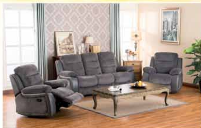
Jessica Grey Fabric all reclining suite 3+1+1 was €2199