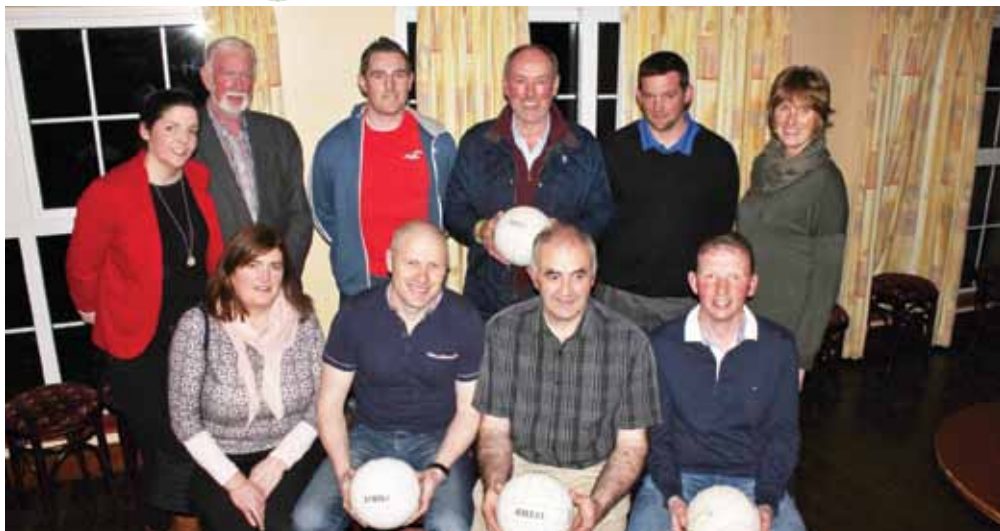
PRESENTATION TO THE LISTRY JUVENILE CLUB FROM THE LISTRY GREYHOUND SUPPORTERS ON THE 21ST OF APRIL IN FAHA COURT BAR & RESTAURANT.

phase one of the County League in style with two hard-fought victories over the Austin Stacks in Connolly Park on Sunday evening. In Division 1A, the Black team played exceptionally well to win 5-18 to 4-06. In Division 1B, the Amber team were crowned league champions on Sunday after they finished top of the pile with five straight wins in the competition. They dug deep and put in a fantastic battling performance to earn a narrow 5-07 to 4-07 victory over the Tralee side. Well done to all the players, coaches and parents on what was a very rewarding and enjoyable campaign.