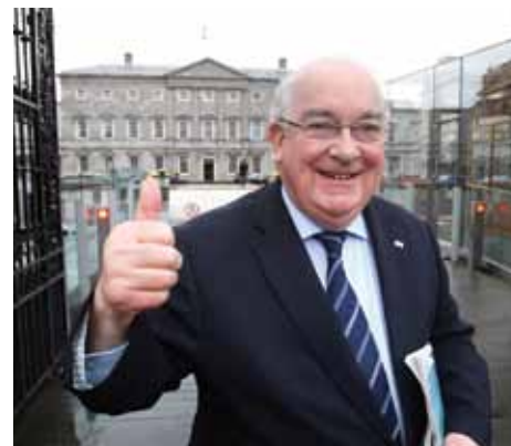
SENATOR PAUL COGHAN RETURNING TO WORK WITH A SMILE FOLLOWING THE RECENT SEANAD ELECTION"