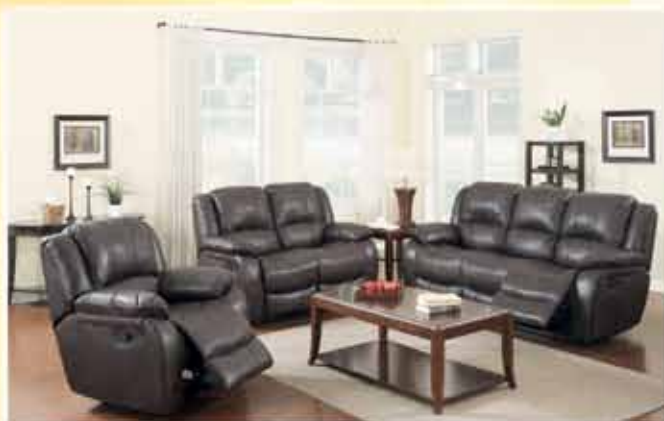
Avana Tan Suite all reclining suite 3+1+1 was €2199