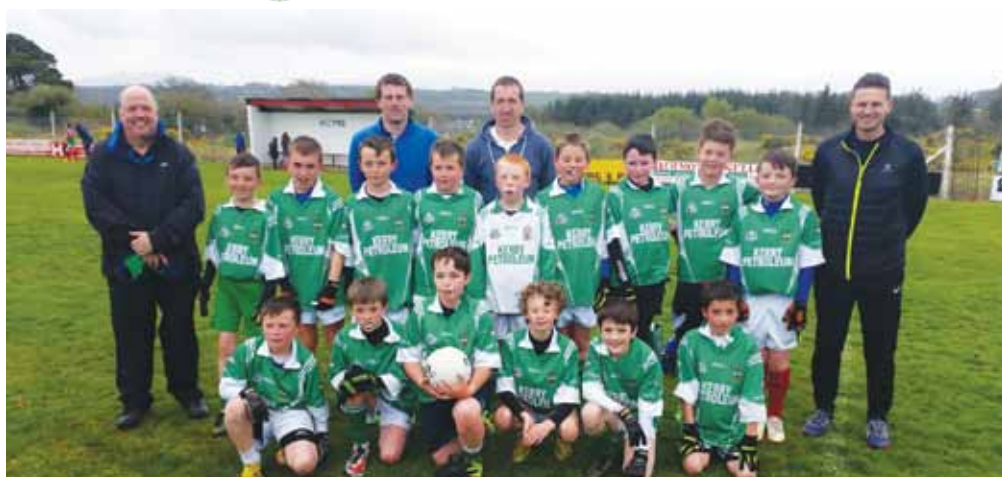
LISTRY U12S WHO BEAT KILCUMMIN RECENTLY.