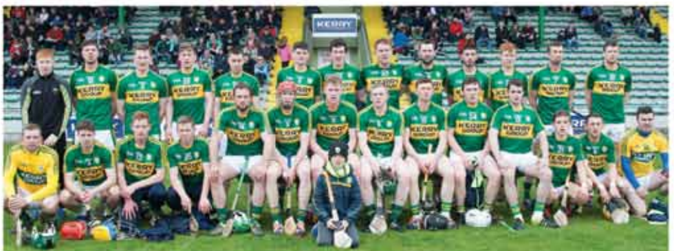
THE KERRY SENIOR HURLING TEAM AT AUSTIN STACK PARK, TRALEE ON SUNDAY.