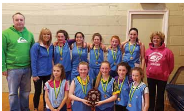
SCHOOLS SUPER SEVENS GIRLS BASKETBALL FINALS: CULLINA NATIONAL SCHOOL SUPER SEVENS PLATE WINNERS 2016.