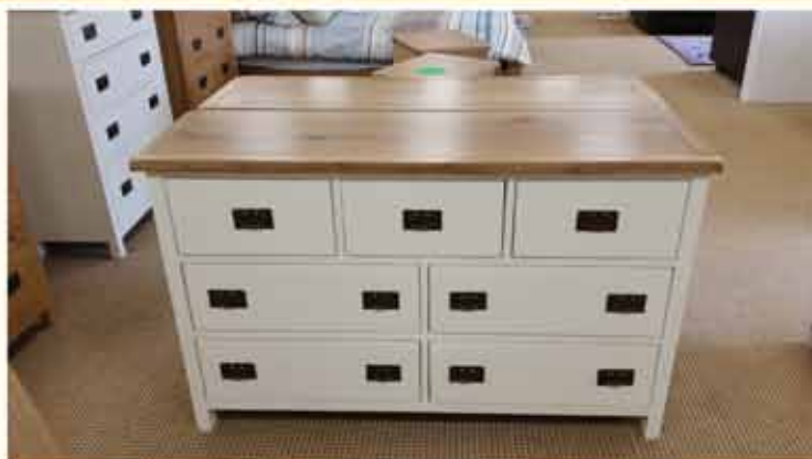
Solid Oak 7 drawer wide chest, in cream & oak Was €499