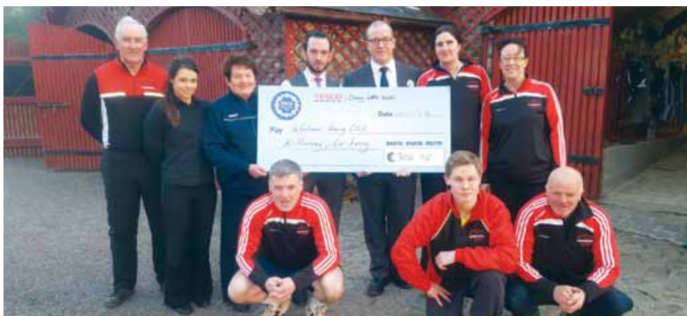
MANAGEMENT AND STAFF OF TESCO DEERPARK PRESENTING CHEQUE TO WORKMEN'S ROWING CLUB COMMITTEE MEMBERS, FOLLOWING THEIR RECENT 'BLUE TOKEN' COLLECTION IN-STORE, AS PART OF THEIR COMMUNITY FUNDRAISER PROGRAMME.

GOOD NEWS: Fundraiser Clothes Collection,