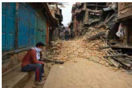
NAPAL EARTHQUAKE DEVESTATED THE COUNTRY.

"We know very extensive damage has occurred with virtually all the houses destroyed and that many people were killed, however, since then