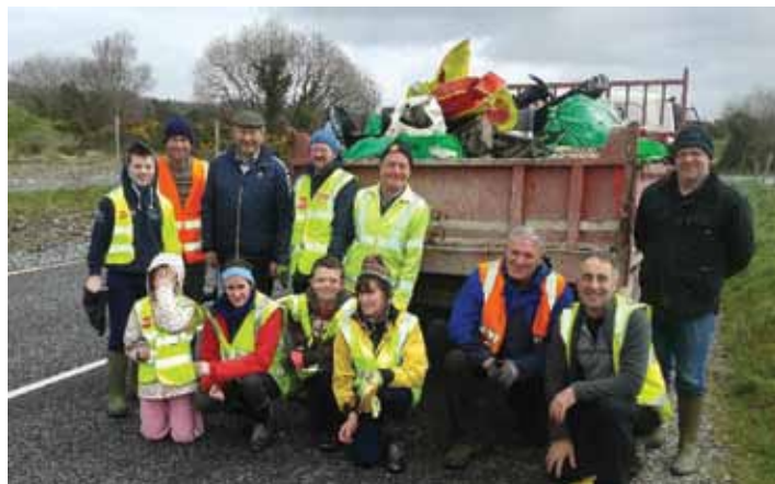
MANY HAND MAKE LIGHT WORK.... RESIDENTS TOOK TO THE HIWAYS AND BYWAYS TO TAKE PART IN A MAJOR CLEAN UP FROM KNOCKNASKEHA/KNOCKNAHOE TO LISSIVIGEEN IN WHICH ONE TONNE OF REFUSE WAS COLLECTED.