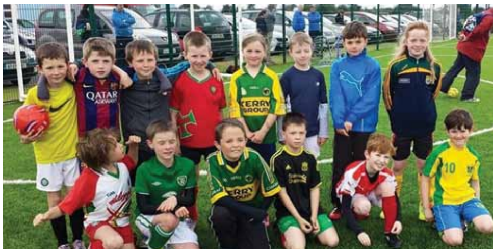
MEK UTD UNDER 9 SQUAD.