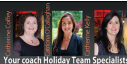
Your coach Holiday Team Specialists