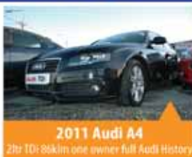
2011 Audi A4

1.6i DSI Alloys, Fogs, Aircon, Cruise control