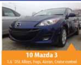
10 Mazda 3

ALL TYRE BRANDS SUPPLIED | FREE TRACKING & BALANCING