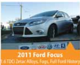
2011 Ford Focus

1.8i, TDI Elegance, one owner Full History