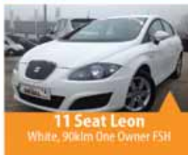
11 Seat Leon

1.6 TDCi Zetec Alloys, Fogs, Full Ford History