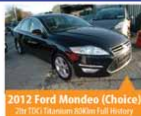
2012 Ford Mondeo (Choice)

2ltr TDI 88kms one owner full Audi History