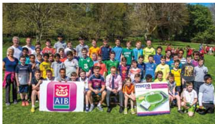
STUDENTS FROM THE MON BOYS NATIONAL SCHOOL WHO TOOK PART IN THE AIB 5K SCHOOL CHALLENGE TO SUPPORT SPA/MUCKROSS ATHLETIC CLUB IN RAISING FUNDS FOR A BRAND NEW 4 LANE TRACK ON THE GROUNDS OF ST BRENDAN'S COLLEGE.

If you want to keep up to date on a daily basis make sure to follow us on @killoutlook