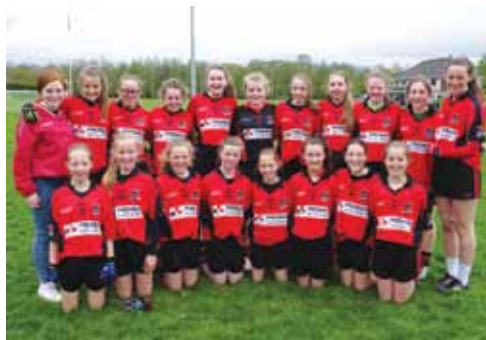
FOSSA TEAM WHICH TOOK PART IN FEILE ON SATURDAY IN FOSSA.

FOSSA GAA: LOTTO: Numbers drawn were 1, 13, 17, 19. There was no Jackpot winner and next weeks Jackpot will be €10,200.