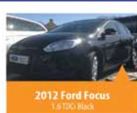
2012 Ford Focus