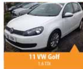
11 VW Golf