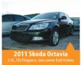
2011 Skoda Octavia

1.8i, TDI Elegance, one owner Full History