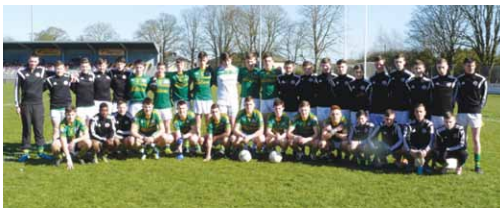
ST BRENDANS U16.5 ALL IRELAND TEAM.

The decision to award Good Counsel a second penalty early in the second half threatened to kill off the game when the margin increased to nine points however the spirit and heart which has been the hallmark of this St Brendans team ensured that they would battle to the end. The introduction of David Clifford along with a number of positional switches gradually saw the sem claw their way back into contention. The deficit was reduced to two points going