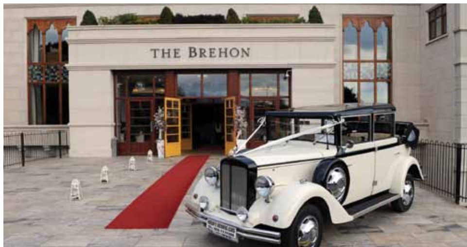
THE BREHON: A FANTASTIC VENUE FOR YOUR SPECIAL DAY.

Wedding fashion will be to the fore at one of Killarney's premier wedding venue, The Brehon when it opens its doors to couples preparing for their big day at a special Wedding Fair on Sunday, September 13.