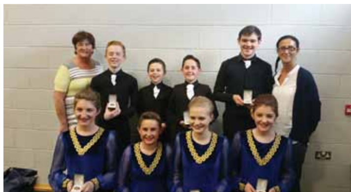
GLENFLESK UNDER 15 MIXED 8 HAND, WHO CAME FIRST IN IRELAND IN FLEADH CHEOIL NA hÉIREANN IN SLIGO RECENTLY.

CONTACT: We welcome items of local interest. Please contact PRO Donal on 087 668 7926 or pro.glenflesk.kerry@gaa.ie.