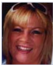
In Loving Memory of