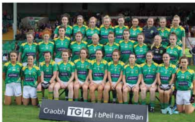
THE KERRY LADIES SENIOR FOOTBALL PANEL THAT WERE DEFEATED BY CORK IN SATURDAY'S ALL-IRELAND SEMI-FINAL IN LIMERICK'S GAELIC GROUNDS.