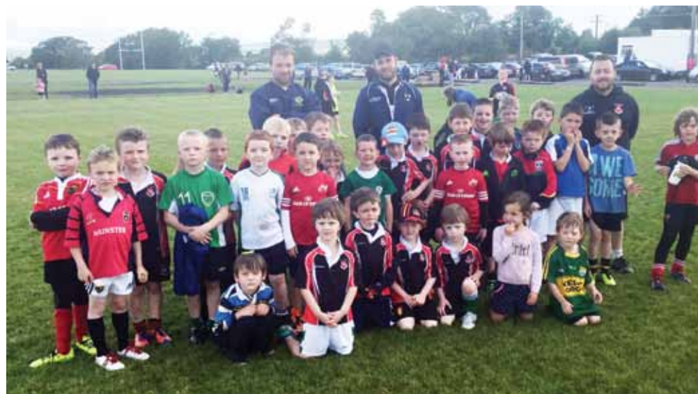
MINI MEMBERS OF KILLARNEY RUGBY CLUB BACK TRAINING AT THEIR NEW GROUNDS IN AGHADOE AT THE WEEKEND.