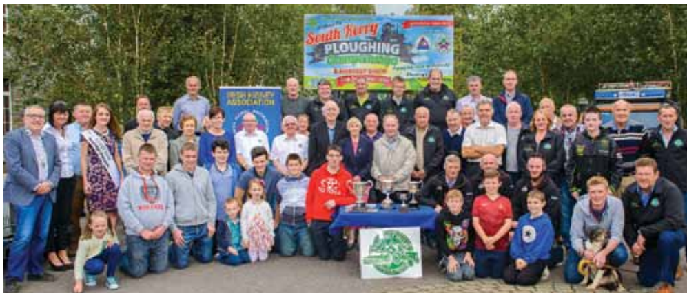
THE LAUNCH OF THE SOUTH KERRY PLOUGHING CHAMPIONSHIPS & HARVEST SHOW AT THE TRAVEL LODGE WHICH WILL TAKE PLACE ON SEPT 13 2014 AT FLEMING'S FARM.

Children and the young at heart will be really well catered for in the super Kids' Zone and funfair, including a novelty Maze in the Maize which proved so popular last year. The main