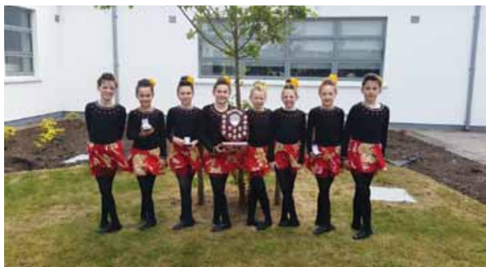
GLENFLESK UNDER 12 GIRLS 8 HAND, WHO CAME FIRST IN IRELAND IN FLEADH CHEOIL NA hÉIREANN IN SLIGO RECENTLY.