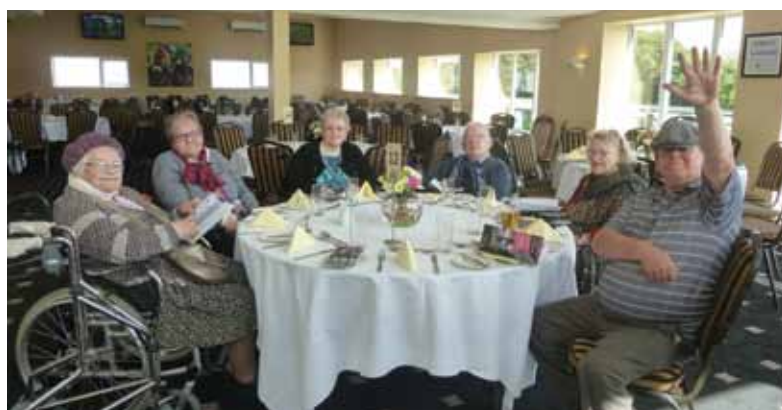
RESIDENTS AND STAFF ENJOYING AN EVENING OUT AT THE AUGUST KILLARNEY RACES. OUR LADY OF LOURDES CARE FACILITY WOULD LIKE TO THANK KILLARNEY RACE COMMITTEE FOR THEIR HOSPITABILITY TO OUR RESIDENTS ON THE DAY.