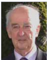
In Loving Memory of