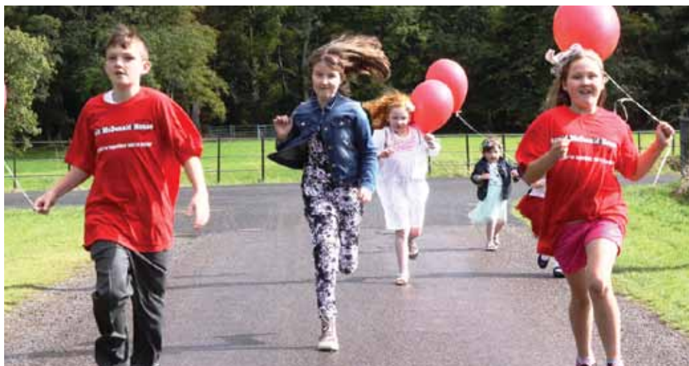
WALKING4FAMILIES TO RAISE FUNDS FOR RONALD McDONALD HOUSE AT CRUMLIN CHILDREN'S HOSPITAL.

"I would be most grateful if the people of Killarney could help me raise funds for this amazing service and while the charity is not